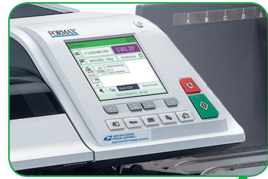
Color touchscreen and shortcut keys for easy navigation and efficient processing