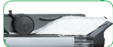
Optional power output conveyor stacker extends for maximum stacking capacity

Formax - New Hampshire, USA www.formax.com