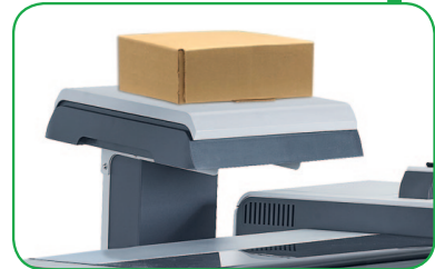
10, 30 or 70 lb. weighing platform