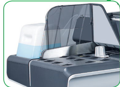
Mixed Mail Feeder easily processes nested or non-nested envelopes and postcards, without sorting by size or weight