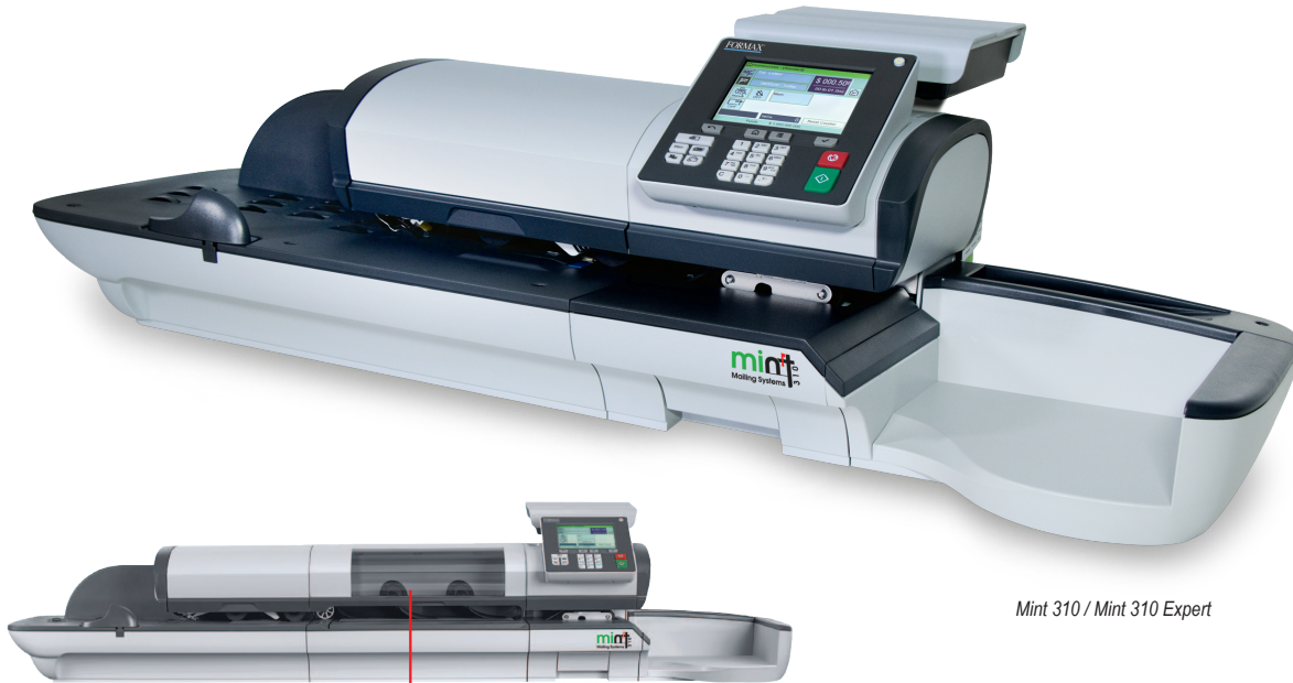
Mint 310 / Mint 310 Expert

System shown with optional dynamic scale