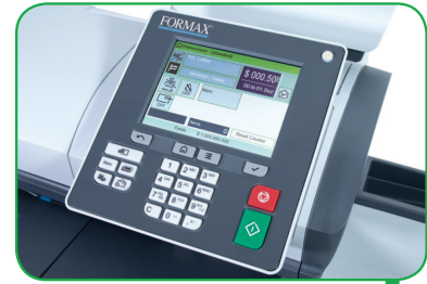
Color touchscreen and shortcut keys for easy navigation and efficient processing