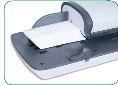
Top-loading Automatic Feeder processes up to 140 lpm / 175 lpm