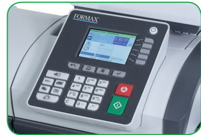
Color screen and shortcut keys for easy navigation and efficient mail processing