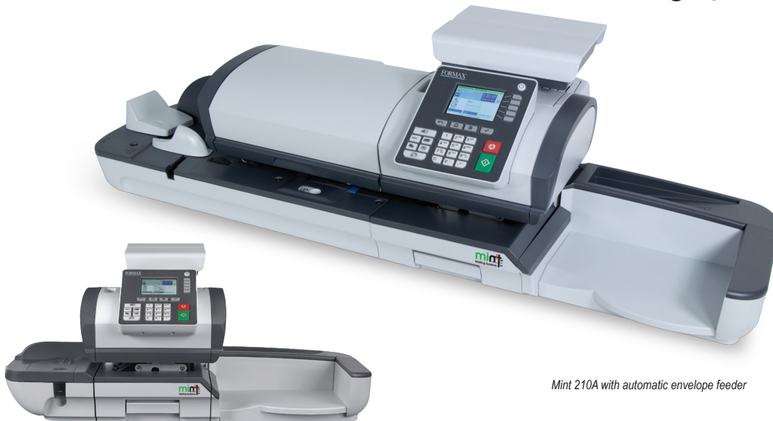
Mint 210S with semi-automatic hand feeder