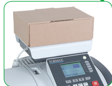
5 lb weighing platform