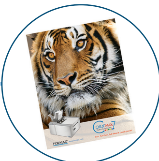
Full-Bleed CMYK Prints Brilliant full-bleed CMYK output on envelopes, and sheets up to 8.5" wide