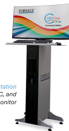
Optional CCS8 Command Station Workstation, PC, and 32" curved monitor