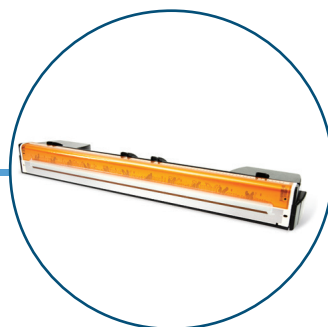
Memjet® Inkjet Print Head Stationary print head is quiet and features 70,400 inkjet nozzles