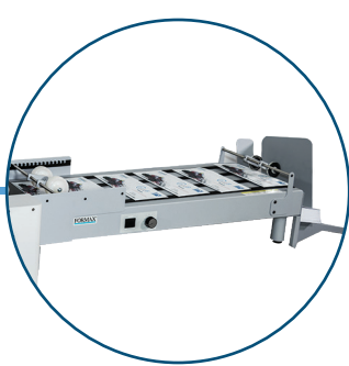
Optional High-Capacity Belt Conveyor Reach production-level output with an adjustable speed conveyor stacker