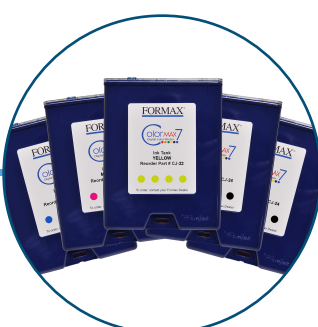
Lower Ink Cost Per-Page Utilizes 5 high-capacity 250ml ink tanks (CMYKK)